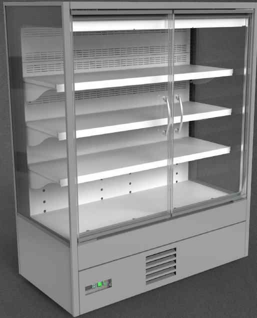
Kaukaz RDKA-15 1250 DVO